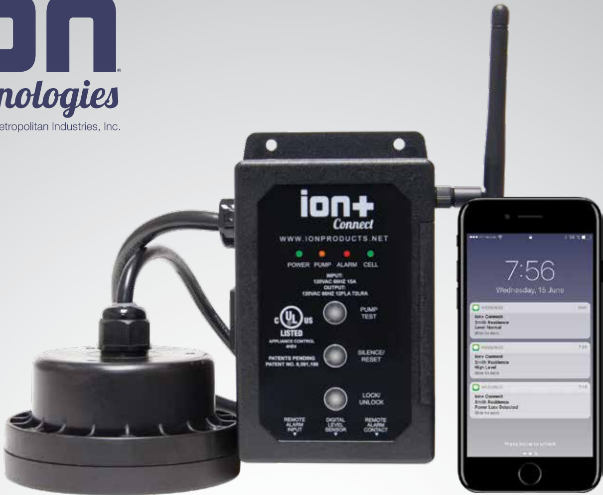
Phone not included